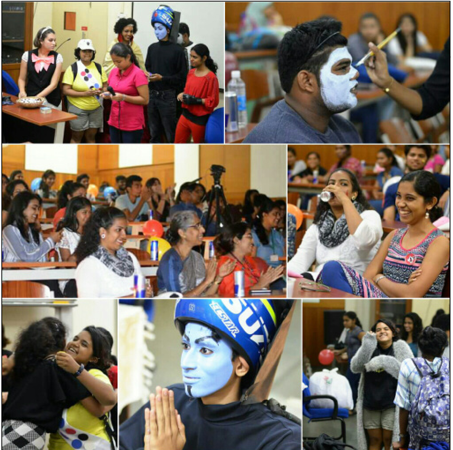
Pic: Alpha Snapshots!

This was not it! The fresher's were once again called down to play Twisters, after which the whole shindig ended with music playing and everyone dancing. What a scene to watch! And finally a lot of photographs were clicked. Alpha ended by 5.00 pm in the evening with a lot of laughter and fun. ***